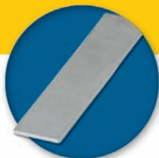
After the cleaning process: Test soil completely removed. Easy assessment.